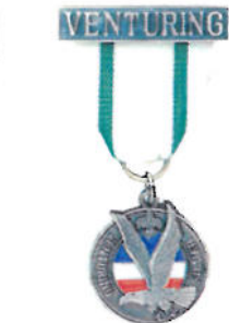
Above—Venturing's Silver Award